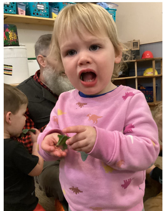
Toddlers tasting kale leaves